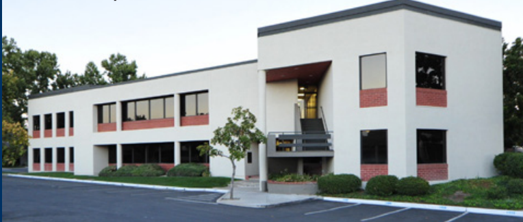
1003 E. Cooley Drive