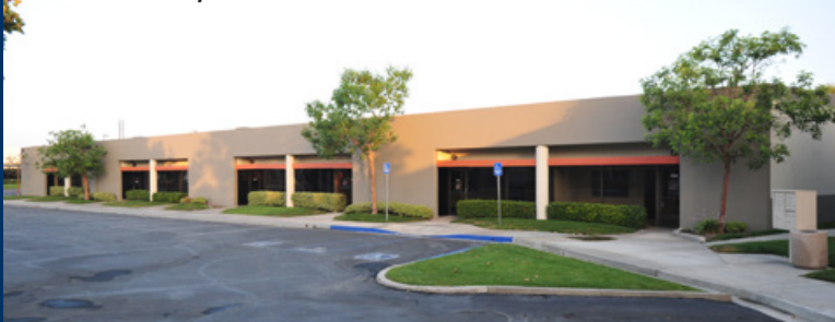
1001 E. Cooley Drive