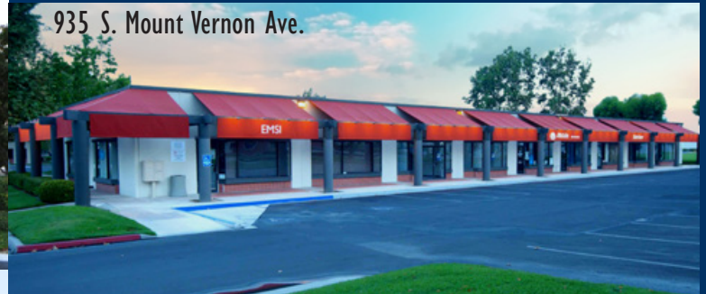
935 S. Mount Vernon Ave.